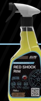
RED SHOCK RIM

Products of this line are used for cleaning and maintenance of tyres, rims and exterior plastics.