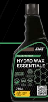
HYDRO WAX ESSENTIALE