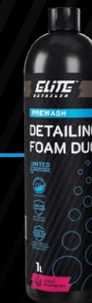
DETAILING FOAM DUO