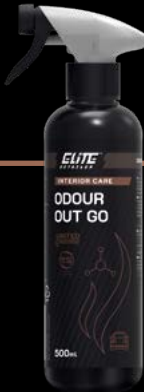
ODOUR OUT GO