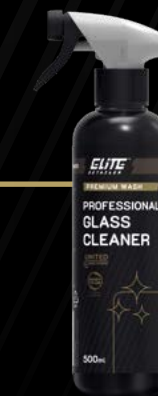
PROFESSIONAL GLASS CLEANER