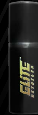
PERFUMES PRESTIGE AUTUMN