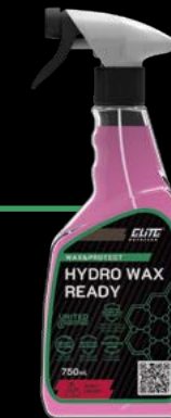
HYDRO WAX READY