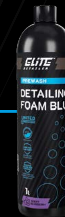
DETAILING FOAM BLUE