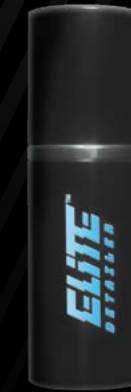
PERFUMES PRESTIGE WINTER