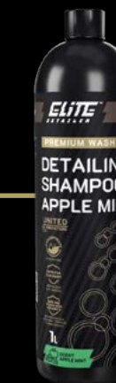
DETAILING SHAMPOO APPLE MINT