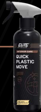
QUICK PLASTIC MOVE