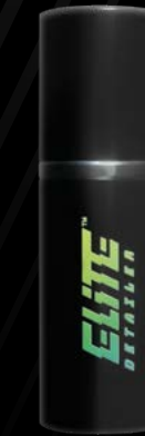
PERFUMES PRESTIGE SUMMER