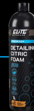
DETAILING CITRIC FOAM