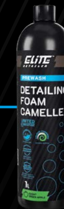
DETAILING FOAM CAMELLEO

Products of this line are used for pre-washing. Their composition guarantees initial softening and removal of dirt, preparing the car body for basic washing.