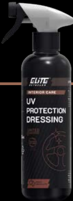
UV PROTECTION DRESSING