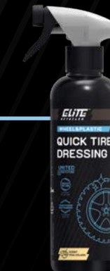
QUICK TIRE DRESSING