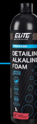
DETAILING ALKALINER FOAM