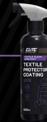
TEXTILE PROTECTOR COATING

Products of this line are used to wash and protect fabrics in the interior of vehicles.